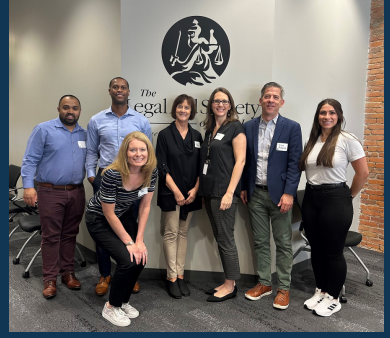
Our Cleveland Hallway continued to turn out in support of the Legal Aid Society