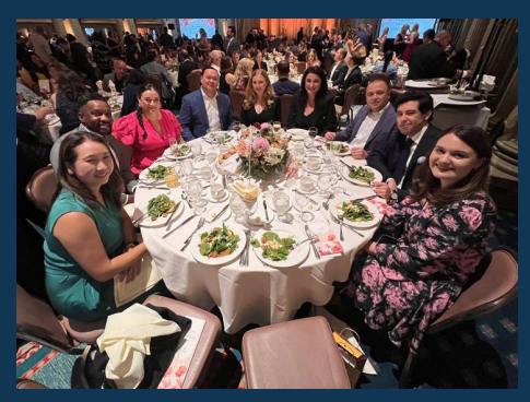
Members of our L.A. Hallway attended a fundraising gala for Harvest Home , a support network for homeless pregnant women.

In 2023, we remained committed partners to numerous philanthropic organizations around the country that are dedicated to fostering equity, diversity, and inclusion. The photos below highlight just some our activities from the year.