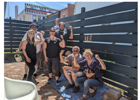
The Cleveland Hallway turns out to support Waterloo Arts.