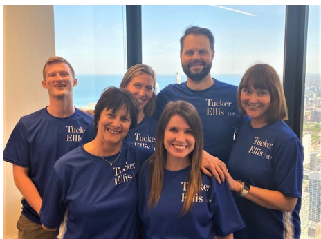
Attorneys in our Chicago Hallway Cycle for Survival for Memorial Sloan Kettering Cancer Center.